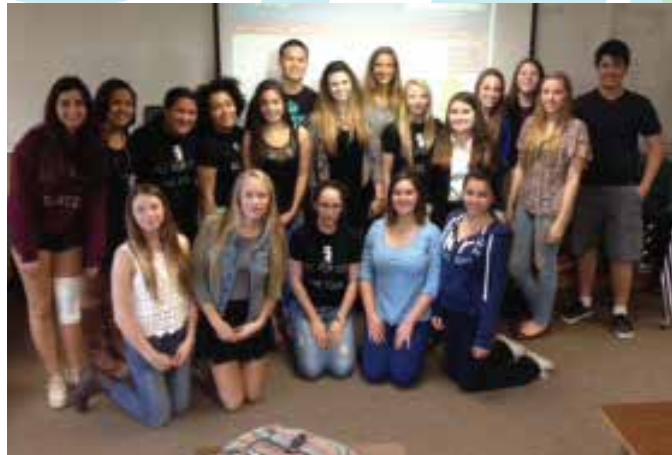
Coronado High students who are part of the CHS Chapter of Health Occupations Students of America (HOSA), one of the STEAM pathways within CUSD.