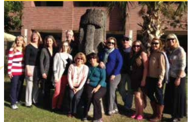
Some of Coronado Unified's newest teachers and support staff who graduated from Coronado High or attended a CUSD school, gathered for a video clip for the upcoming Connect-A-thon on March 13th.